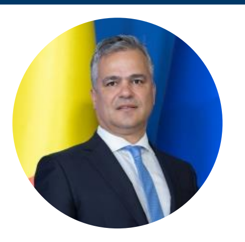
Adrian-Ioan VEȘTEA Minister of Development, Public Works and Administration (tbc)