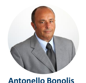
Aviation Business & Corporate Communication