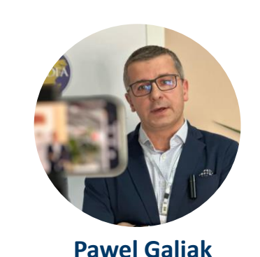
Director of Aviation and Commercial Services, Kraków Airport